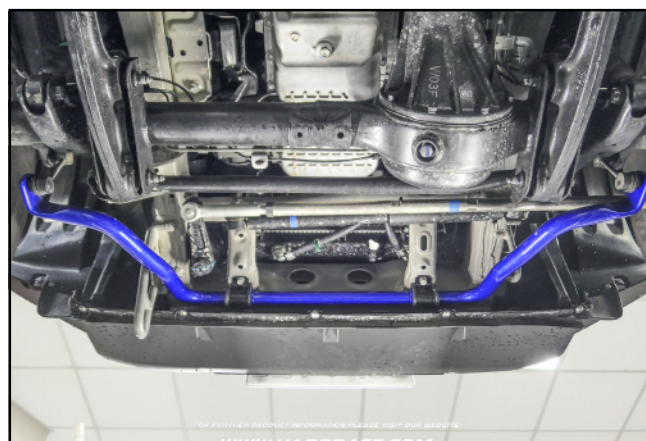
Illustration of installed state 安裝完成示意圖