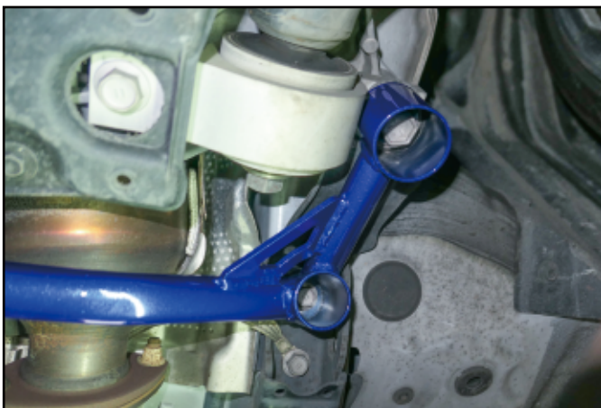
See figure 2 (參考圖表二)