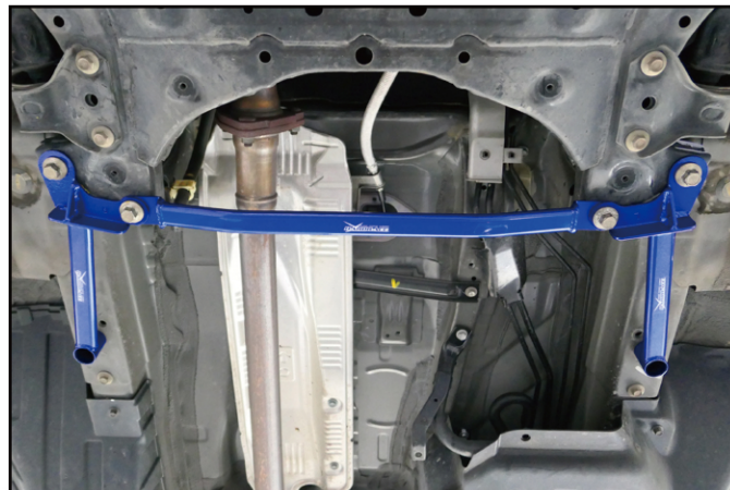
▼ Illustration of installed state 安裝完成示意圖