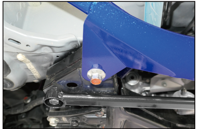
See figure 1 (參考圖表一)