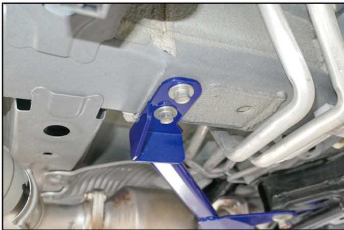
See figure 2 (參考圖表二)