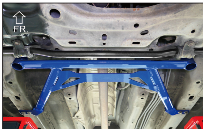
Illustration of installed state 安裝完成示意圖