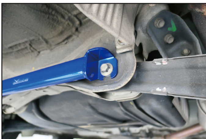
See figure 1 (參考圖表一)