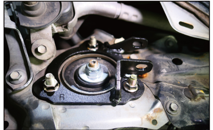
▼Illustration of installed state 安裝完成示意圖