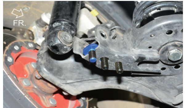
Illustration of installed state 安裝完成示意圖