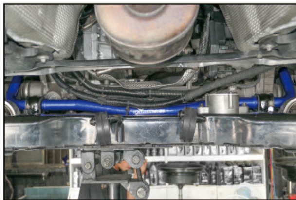
▲ Illustration of installed state 安裝完成示意圖