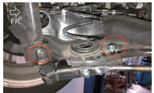
Illustration of installed state 安裝完成示意圖