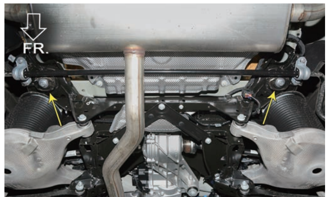
Illustration of installed state. 安裝完成示意圖