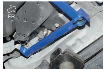
Illustration of installed state. 完成示意圖。