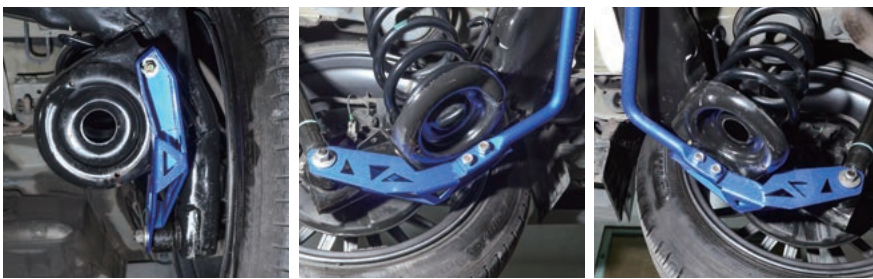
Figure of installation (LH/RH). 左 / 右安裝示意圖