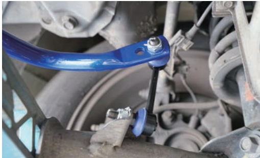
Stiffness adjustable 軟硬可調

※ Please read the HARDRACE Tech Tips before installing the products. 在安裝之前請詳閱 HARDRACE 技術提示