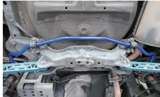
Figure of installation 安裝示意圖