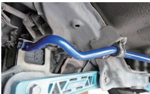
Recommended Torque for bolts/nuts 螺絲/帽鎖緊扭力參考