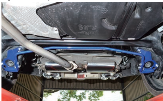
安裝完成圖 Figure of completion